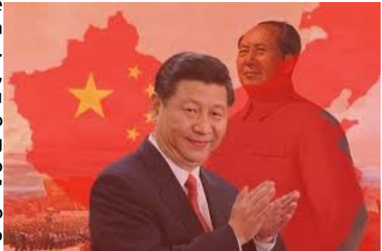
Gnl Xi Jinping, SE w' Ishyamba rya Gikomunisti ry' Abashinwa, akanaba Perezida wabo

Abarusiya n' Abashinwa basanga Afrika ibonye amahoro, yatera imbere. Babihera ko mu ntangiliro za 1900, Amerika yali ku rwego Afrika igezeho ubu. Diplomatie n' ingabo Abarusiya akaba alibo babikora, Abashinwa bakibanda ku bukungu. Mu kulinda inyungu zabo, nta seigneur de guerre cg impunzi bakeneye 47 kuko nta guerre hybride bateganya(uretse défensive cg neutralisation ). Barashaka ko amategeko mpuzamahanga yongera akubahilizwa, kimwe n' ubusugire n' imico y' ibihugu 48 . Nta mutungo karemano utasanga mu butaka bw' Abarusiya kandi ku buryo buhagije, bakaba bakeneye iyo mitungo kuyiteza imbere muli ibyo bihugu, igihe bikomeza inshuti zabo. Bumva ikihutirwa ali ukubanza guteza imbere ubuhinzi, bagahabwa technologie y' ibanze, na maîtrise ya énergie bo bakibanda mu ihangana ryo hejuru cyane cyane intelligence artificielle bakanateza abaturage babo n'ubukungu imbere nk' uko bamaze kubigeraho mu bya gisilikare, aho beretse igihandure Amerika.