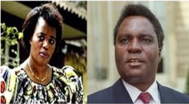
PM Mme Agathe Uwilingiyimana na Perezida Habyarimana

"Perezida Habyarimana yitegererezanya akanyamunze amacakubili muli MDR ashaka no kuyabyaza umusaruro yemera kugira Premier Ministre igikomerezwa kili mu gice cyanzwe urunuka, ariwe Madamu Agathe Uwilingiyimana. "Le président Habyarimana observa avec délectation une certaine délectation les divisions au sein du MDR voulut en profiter en acceptant comme Premier Ministre une personnalité de la tendance la plus impopulaire, a savoir Mme Agathe Uwilingiyimana" .