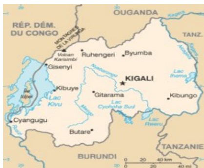
Ikarita y'u Rwanda