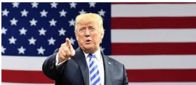
Perezida Donald Trump w' Amerika

Muli icyo minsi Kagame yanyarukiye muli Banque Mondiale naho ajanywe n' uko gukeza byamulyalyata 36 haAkubitanira n' injanwe y' umukara yali yahukanye, yikoreye amavaliyo yayo: Paul Waulfovitz, wahoze ari Umujyanama wa President Bush, akanaba n'umwe mubahanze " mondialisation ", mu yandi magambo – politike yahaye ingufu n'ireme FPR–, yabajije bagenzi be – diplomatiquement yabamutumyeho – agira ati: " Aliho uyu we akorera i Gihugu cy' n' Abaturage be lyali "!? Mu yandi magambo ploutocratie ya FPR yitwako yali ibabereye ahakomeye, ntiyumvise ko nyuma yo gukubita ufangura, FPR aho kwilirwa inezesa ingeso y' inzangano n' irali muli byose ihera kuli éléments de langage zitabajwe 37 ngo zihishire ibyabaye nyakuli ifata ubutegetsitsi, yali ikwiye gukunjira amaboko y' ishahati, ikubaka Umulyango Nyarwanda, i Gihugu n' akarere. Icyo kikaba alicyo yapfanaga na " Monde Unipolaire ".