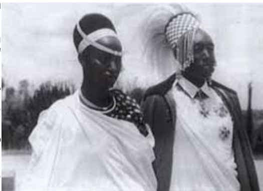
Umwami Mutara III Rudahigwa n' Umwamikazi Gicanda

Urg: Akoresheje iteka ryo kuwa 14 Nyakanga 1952, Mutara wa III yashyizeho Inama Nkuru y' Igihugu (cg CSP mu magambo ahinnye). CSP yali igizwe n' Abatutsi gusa, yiremamo Komite yo gusuzuma ikibazo mbonezamubano mututsi-muhutu-mutwa. Iterana kuva muli Werurwe kugeza Mata 1958. Kuva taliki 9 kugeza