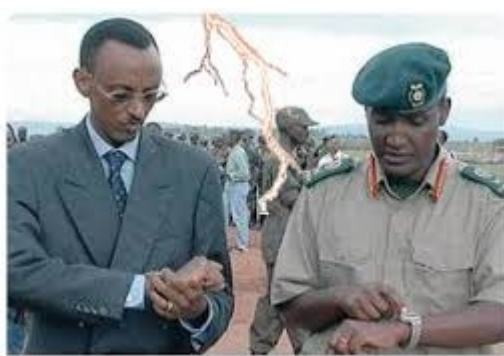
Gnl Kagame Perezida w' u Rwanda na Gnl Kayumba

Ibi ni bimwe " Monde Tripolaire " ivugako ibintu nk' ibi Abanyamerika bagiye bakoresha ngo bahindure ubutegetsi ku nshuti zabo zitabumvira ( Révolution de couleur ) cg kubo zita abanzi hitwaje intwari; abanyagihugu babyo bakitirwa kurwanira demokarasi 19 , hakaba hali agatsiko aka n' aka kali muli hoteli aha n' aha kitwa ko kabahagaraliye, inama z' abiyita ko ari inshuti z' icyo gihugu kilimo kulimburwa zigakorwa; imiryango mpuzamahanga y' isi n' itangazamakuru bigahaguruka 20 ,