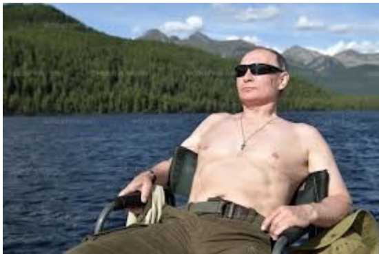
Col Vladimir Poutine, Perezida w' Uburusiya

Ibi biratugaragaliza ko nta makiliro ploutocratie ya FPR ifite ku ruhande rwa "Monde Unipolaire". Bikaba biyigoye cyane kuko ikibazo muli yo Trump yaretse capitalisme y' urusimbi ("capitalisme spéculatif") yajyanaga no kugira isi nk' umudugudu ( mondialisation ) akaba alimo gushaka kugaruka kuli capitalisme ifitiye benshi akamaro ("capitalisme productif") bikamusaba guca ukubili na mondialisation yali igikoresho cya "Monde Unipolaire", [Amerika ikongera kuba igihangange ( America great again )]. Uretse n' incuti z' America zifite amaturufu ahagije, ndetse n' Abanyamerika ubwabo bafite za jokers, politike iragaragara nk' urudubi (chaos). Bikaba byumvikana ko igihugu gikinisha inganda z' intuyu nka ploutocratie ya FPR, ikibazo ali insobe 42 .