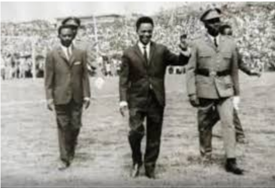
Perezida G. Kayibanda na Col Habyalimana, Ministre w' Ingabo n' Igipolisi

nk'Igisuti kili hejuru ya buli Munyarwanda, aliwo urubereye; kwishyira hamwe biroroha, impaka zisobanutse zikagibwa.