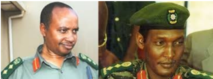
Col Karegeya wamaze kwicwa na Gnl Kayumba bahunze FPR, akaba agezwe amajanja n' urufu ubugira gatatu

Yego muli 1991, Habyalimana yokejwe igitutu n' Ububiligi bwali bwarabungabunze imizamukire ye mu ntera kugeza acuje Rubanda ubutegetsi, yali yaramaze kugambanira u Rwanda, ahindura abasilikare b' Abagande bali baravutse mu mpunzi z' Abanyarwanda zali zarahungiyeye muli icyo gihugu, abahindura Abanyarwanda. Intambara y' iterwa ry' u Rwanda (" Guerre d' agression contre le Rwanda ") ihinduka intambara y' Abanyagihugu ( Guerre civile au Rwanda ). Aya mafuti yatumye intambara ikomeza 22 , iza no kugusha kuli Génocide . Urukiko Mpuzamahanga Mpanabyaha ku Rwanda, rwagombaga kubunga, ntirwigera rusuzuma Icyaha gikorewe amahoro ( Crime contre la paix ), bizwi neza ko ali ikimane cg se nyina w' ibindi byaha byose. Haba no gusuzuma ikibazo cy' indege y' u Rwanda yali itwaye Perezida warwo ndetse n' uw' u Burundi, yahanuwe taliki 06.04.1994 na FPR 23 , bigakongeza Génocide !