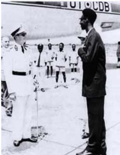
Umwami Kigeli V Ndahindurwa

Urwego 3: Ibikorwa by' ubwihebe mu buhubutsi: biba bigaragalira buli wese ko sosiyete iba ishobora kulimbuka ndetse n' indatwa zitazarokoka. Ibinyoma bigafashwa hasi, mu kwiheba kandi huti huti, hagafatwa ibyemezo nk' amahirwe ya nyuma yo kwirokora imburagihe.