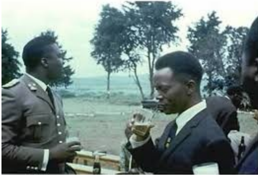
Taliki 4.4.1973, Gnl Habyalimana ataha ipeti na Perezida Kayibanda

bugumaho. Ntawasobanura ko ibi bitabaye ubugambanyi kuli Rubanda cyane cyane mu karere yali iboshywemo biturutse ku buhake bw' ubutaka . Demokarasi yali nk' ikiza