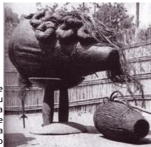
Kalinga, ingoma yarangaga Ubwami

U Rwanda rwabaga rwugaliye n' amakuba arenze gukomera, yagiye ayogozwa i Gihugu kigasigara iheruheru; kikuzura imiborogo n' imivu y' amaraso. Buli gihe kandi amage, cg akangaratete kabanza kabaga koroheje kurusha akagakulikiye. Bigeza ubwo i Gihugu cyenze kulimbuka 2 . Ayo akaba ali amarenga ko muli iki gihe U Rwanda rwugaliye n' icyago gishobora kukilimbura niba nta mivuno