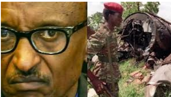
Gnl P. Kagame Perezida w'u Rwanda n' ibisigazwa by' indege y'u Rwanda yaguyemo Baperezida Habyalimana na Ntaryamira w' u Burundi

Haba mu gihe cya "Monde Unipolaire" cg muli uku kuvaho kwayo yimukira "Monde Tripolaire", Umuryango Nyarwanda wahuye n' ibiza rulimbuzi. Muli iyo ya mbere, byoroheye indatwa za FPR kurenza umunsi, bitewe n' impamvu nyinshi, aliko cyane cyane gukingirwa ikibababaturaga FPR imera nk' umwana uli iwabo uvuna umuheha akiyongeza undi. Mu bindi byayiteye kuramba hakabamo amakosa menshi y' indatwa zitavugaga rumwe nayo.