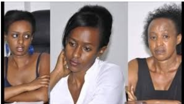
Umufasha n' abana ba Rwigara bafashwe gbagafungwa na FPR